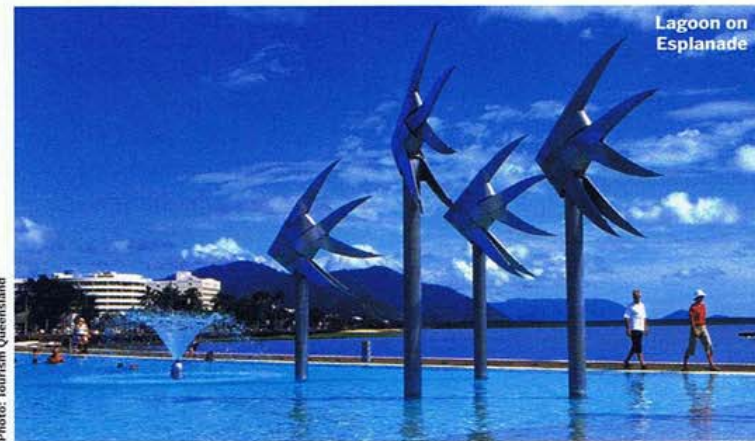
Lagoon on Esplanade